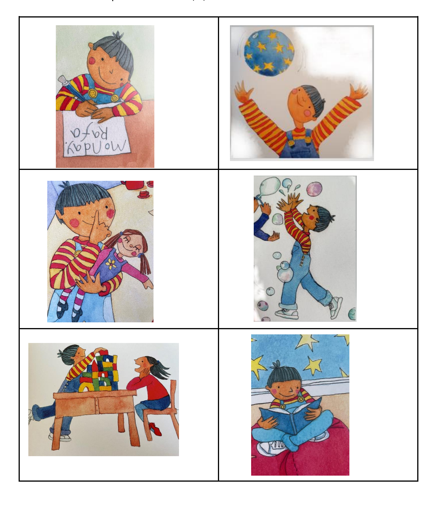
Print and laminate copies for activities 1, 2, 3 and 7.